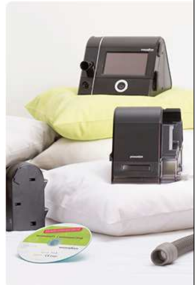
prismaLINE add-ons and accessories

*Legal regulations limit availability to certain countries.