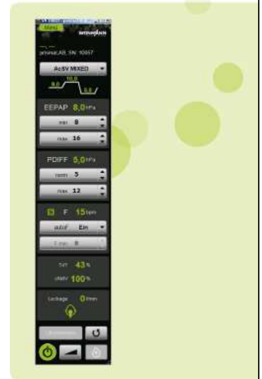
Remote operation prismaTSlab