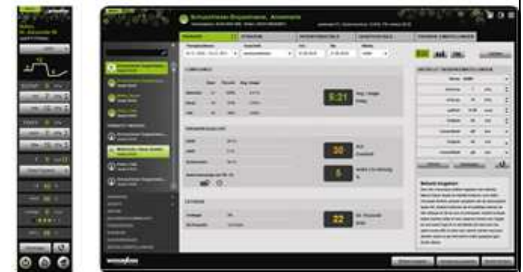
Therapy software prismaTS